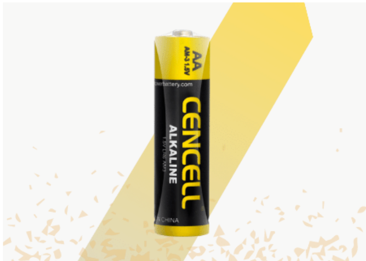
Size: AA / LR6, 1.5V