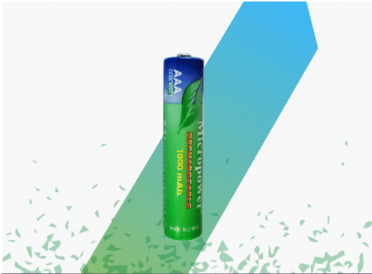
Size: AAA 1.2V